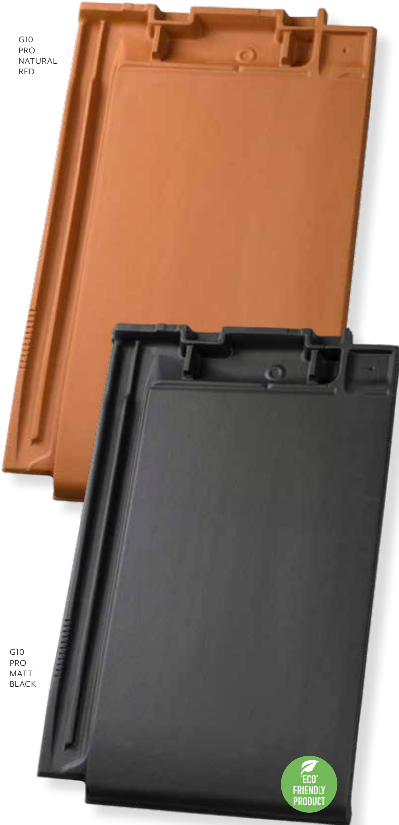
G10 PRO MATT BLACK

These tiles are superbly engineered and designed for a quick, easy and secure installation and are ideal for use with low pitch roofs. The G10 PRO can also be used for vertical cladding on walls and façade.