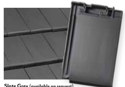
Slate Grey (available on request)